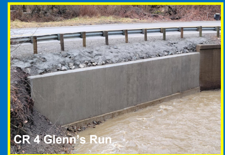
CR 4 Glenn's Run