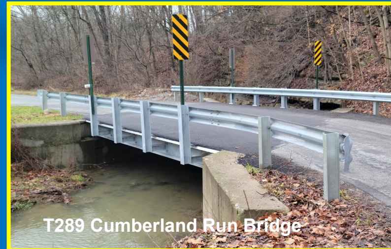
T289 Cumberland Run Bridge

November began with more good news, we completed another pair of FEMA slip projects on CR 22 Ferryview Road and CR 44 Winding Hill Road. The combined project was built by OWV for $334,188.50 with the same FEMA funding splits as before. The bridge crew installed our 55-foot temporary bridge at the end of Richland Twp. T-431 Jug Run in preparation for an upcoming bridge replacement project in the spring of 2024. The road crews continued ditching on many of the County's roads, and their work is paying off with every heavy rain event we see. They also did some tree trimming on CR 10 Black Oak Road and replaced another culvert on CR 10 Fairpoint Maynard Road. The bridge crew replaced some damaged guardrail on a bridge on Richland Twp. T-215 McBride Hill Road. We ended November by opening bids on the 29 th on an OPWC emergency grant project. This project will repair two more slips on CR 42 Fulton Hill Road. The winning bid was for $436,256.00 by the