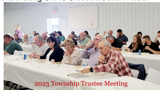
2023 Township Trustee Meeting

In May we took advantage of the wet weather by dragging and stoning some of our gravel roads. We also completed our new FHWA-mandated bridge load ratings. On CR 108 North Road, Shelly & Sands laid down a 2.33-mile asphalt leveling course, part of an on-going resurfacing effort. The $182,548.46 project was paid for by the Engineer's Office MVGT funds. The road crews were busy with ditch work on CR 46 New Cut Road and CR 4 Hawthorn Hill Road. They also began hot patching on CR 104 Smith Road, CR 72, Belmont Ridge Road, and CR 44 New Cut Road. We held our annual township meeting on the 17 th at the County Fairgrounds. The larger facility was more comfortable, and we had a good-sized crowd. The bridge crew completed the Pultney Twp. T-304 Trough Run Road bridge on the 25 th . The $99,010.00 project was funded by the Engineer's MVGT funds. They also completed guardrail repairs on CR 42 Fulton Hill Road and CR 46 New Cut Road. Meanwhile the road crews replaced culverts on CR 72 Belmont Ridge Road and CR 5 Ramsey Ridge Road. Ohio West Virginia Excavating (OWV) completed two slide repairs on CR 5 Crescent Pleasant Road as part of the 2018 FEMA disaster. The projects were funded 75% by FEMA, 12.5 % by SB 299, and 12.5% by the State of Ohio. Finally, the bridge crew placed stone fill for erosion control along CR 10 Crescent Barton Road.