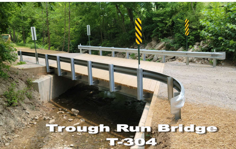
Trough Run Bridge T-304

As our unusually mild winter gave way to an even milder April spring, the road crews were out cold patching and cleaning up downed trees. Cross culverts on CR 2 Deep Run Road and CR 108 North Road were replaced ahead of upcoming resurfacing projects. Our crews also placed stone fill for erosion control along CR 5 Willow Grove Road and CR 54 Pipe Creek Road. The first round of guardrail spraying was applied just as the weeds were trying to get a good start. The road crews ditched along CR 104 Smith Road, CR 78 National Oco Road, and CR 56 Vineyard Road. They also cleaned up a mud slide on CR 16 Nixon Run Road. On the 19 th we opened bids on the annual chip seal project. The bid was awarded to Youngblood Paving for $1,587,322.22 and included work from eight different townships as well as almost twenty-seven miles of County roads. Several culverts were also unplugged on CR 56 OK Road, CR 56 Country Club Road, and CR 54 Pipe Creek Road. On the 21 st , we held our annual safety meeting at the Roscoe Garage. The road crew finished the month by digging out some soft areas on CR 72 Belmont Ridge Road, in preparation for the upcoming chip seal project.