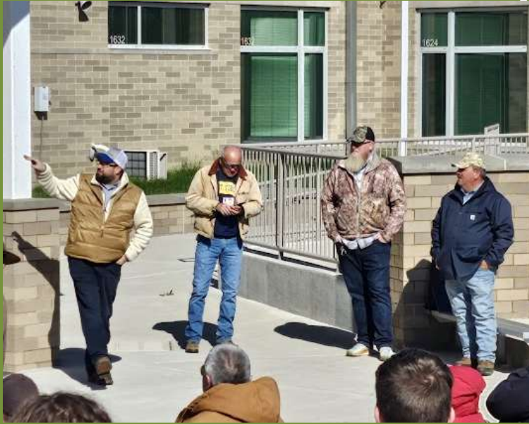
OHIO VALLEY SURVEYORS