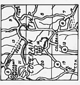
LOCATION PLAN SCALE IN MILES