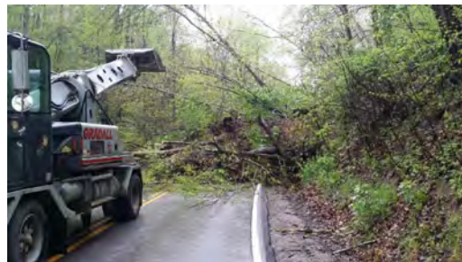
Major landslide on County Road 16 Nixon Run Road