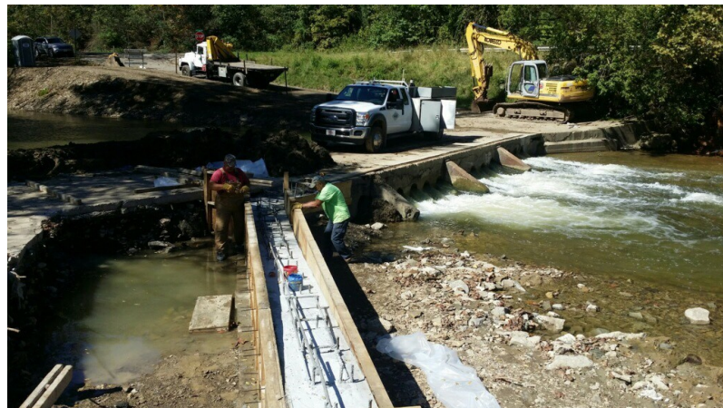
Work is underway to improve the approaches to the Gordon Sub bridge.