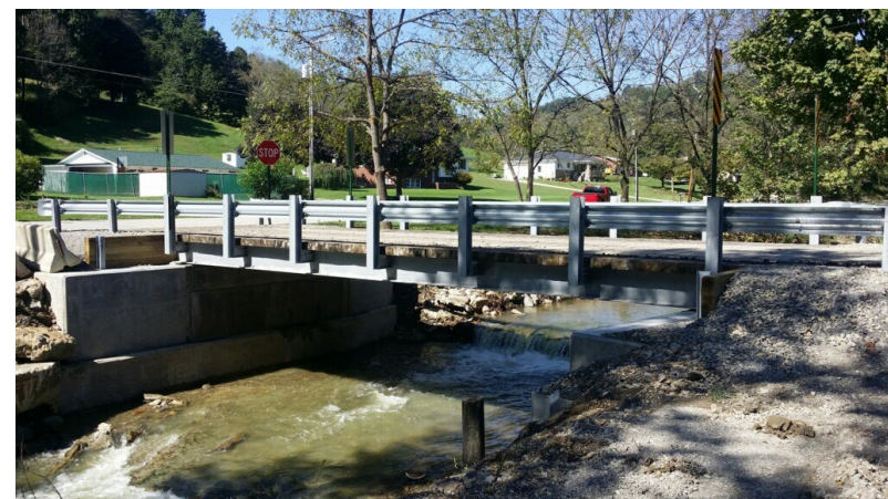
Newly completed bridge on Richland Township Road 1249.