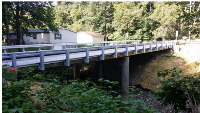
New bridge on County Road 16, Nixon Run