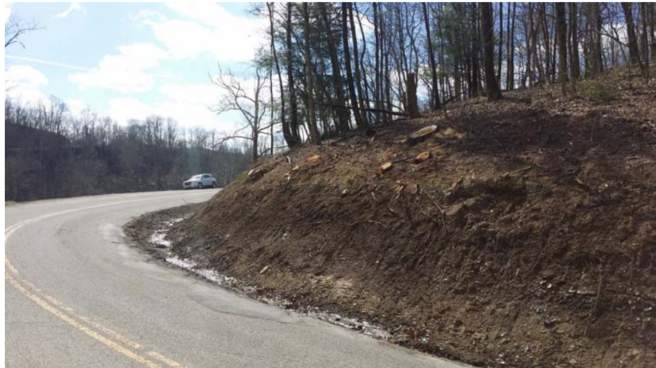
Embankment work was recently done on this turn on County Road 4 Barton Road in an effort to improve drainage.

April 28, 2012 at the Roscoe Road Garage beginning at 8:00 A.M. The County Engineer's Offices and Garages will be closed for the day.