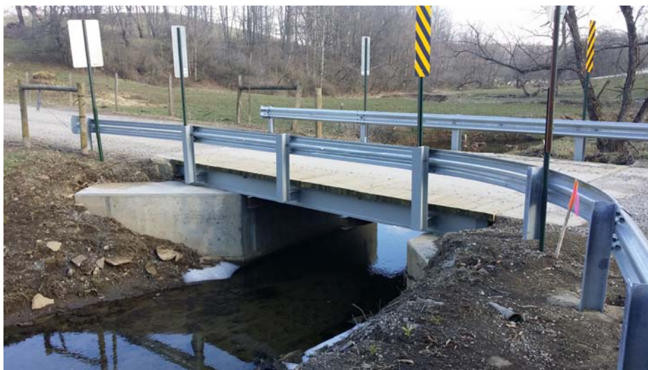
New bridge on Goshen Township Road 200 Gregg Road.