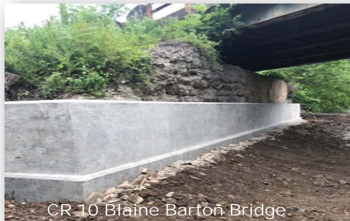
CR 10 Blaine Barton Bridge

We began April with our bridge crew finishing up a box bridge on Mead T-239 West Pipe Creek Road. The new precast 14'x6' structure replaced twin rusted-out metal pipe culverts, and was funded through the Engineer's MVGT funds. In-between the spring storm tree clean-ups, our road crews kept busy with arm mowing, cold patching, ditching, stoning gravel roads, and culvert replacement projects on CR 5 Crescent Road, CR 102 Mt. Olivett Road, CR 124 Wright Road, and CR 26 South Road. The bridge crew placed a concrete liner in twin pipe culverts on Flushing T-351 Rouggen Road, and replaced guardrail on CR20 Blaine Chermont Road. On April 21, we opened bids on our annual chip seal project, once again combining with five of our Townships: Colerain, Pultney, Richland, York, and Washington. The program was once again a huge success, as we attracted more bidders and received the lowest prices to date. The winning bid was submitted by Allied Construction in the amount of $621,668.00, of which $273,308.57 was on County roads paid for by the MVGT funds. The bridge crew trimmed trees on CR 108 North Road, and began a major foundation underpinning project on CR 10 Blaine Barton Road, while our maintenance crews conducted our spring truck inspection. Finally, emergency repairs on CR 48 Wegee Road/T-716 Lashley Road were completed and the road reopened.