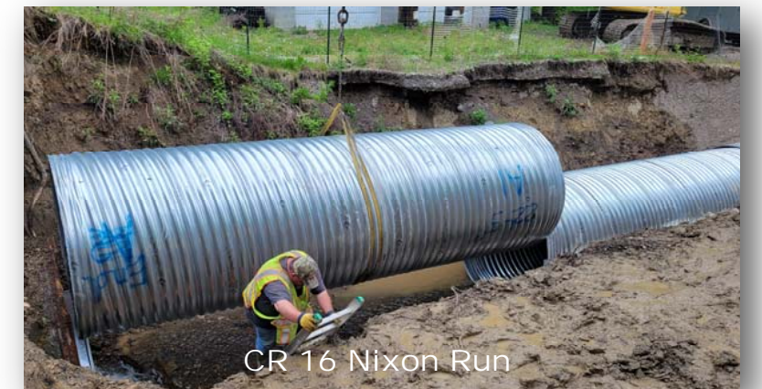
CR 16 Nixon Run