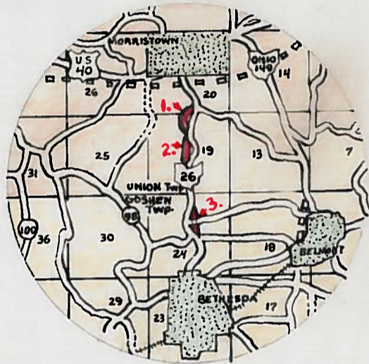
DESCRIPTION OF THREE SECTIONS OF OLD MORRISTOWN BETHESDA ROAD TO BE VACATED