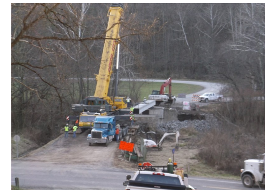
Setting concrete box beams on County Road 92, New Castle Road, at the intersection of State Route 148. This bridge was a project paid for by Gulfport Energy.