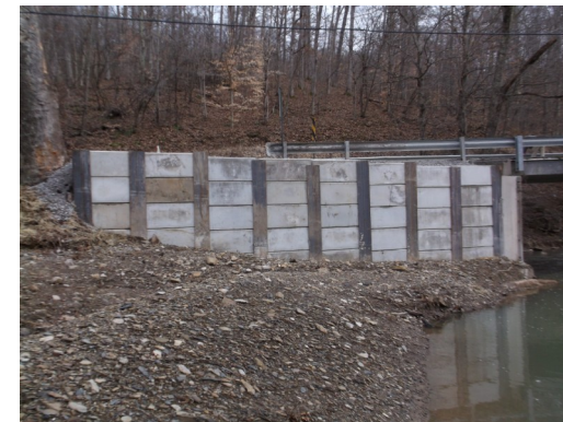
Piling wall project on Washington Township #103 which was part of Project 17-4.