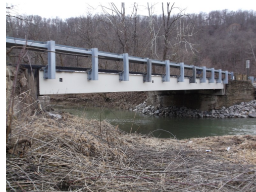
Finished bridge on County Road 92.