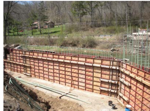
South abutment being built on County Road 4, Sand Hill bridge replacement project.