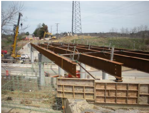
New bridge being built on County Road 26 over Interstate 70.