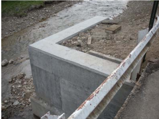
Work continues on the wingwalls of a bridge on County Road 56, Cats Run.