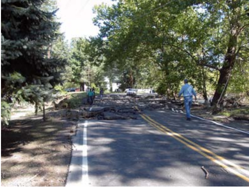
County Road 10 Barton Crescent Road

During September 2004, the remnants of Hurricanes Frances and Ivan swept through the Ohio Valley. The torrential rains on September 19th resulted in an estimated $20,000,000 of damage to county roads and bridges. This was declared as FEMA Event 1556.