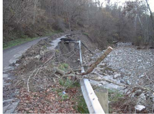
County Road 54 Pipe Creek Road