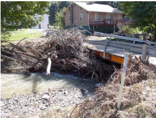
Township bridge off of County Road 4 Willow Grove Road