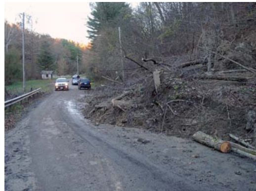
County Road 4 Glens Run Road

Belmont County was already recovering from FEMA Event 1507, which occurred on January 4, 2004. Additionally, on January 6, 2005 another weather related event was declared as FEMA Event 1580.