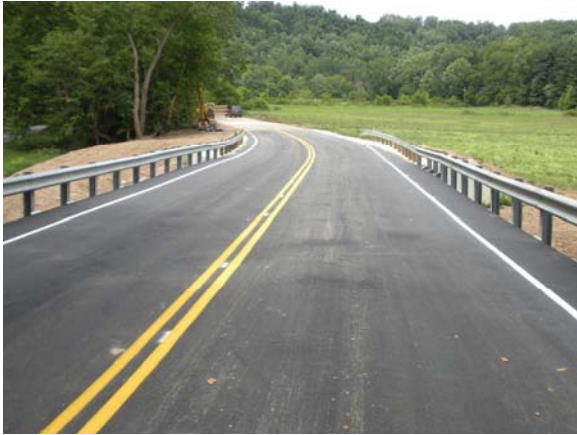
Looking east to west.