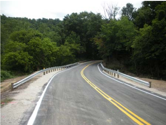
Looking west to east.