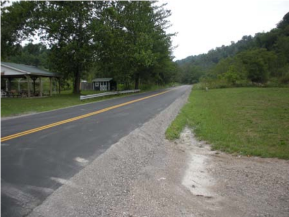
County Road 4 from Neffs going west.