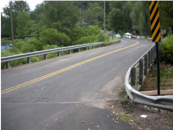
County Road 4 at Jungle Inn Road.