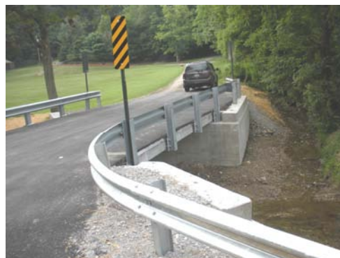
This bridge crew recently completed this project on Somerset Township Road 30.