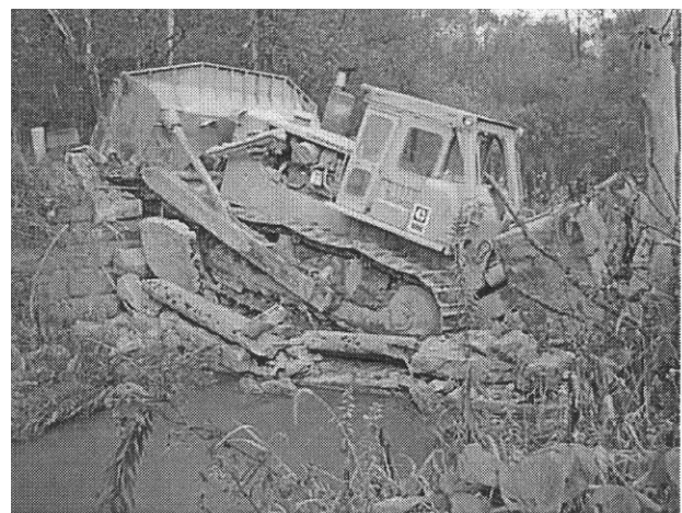
Long Run, Goshen TR 192

In 1994, because of changing laws, the Annual Employee Safety Training was expanded to 8 hours and covers a wide range of safety topics.