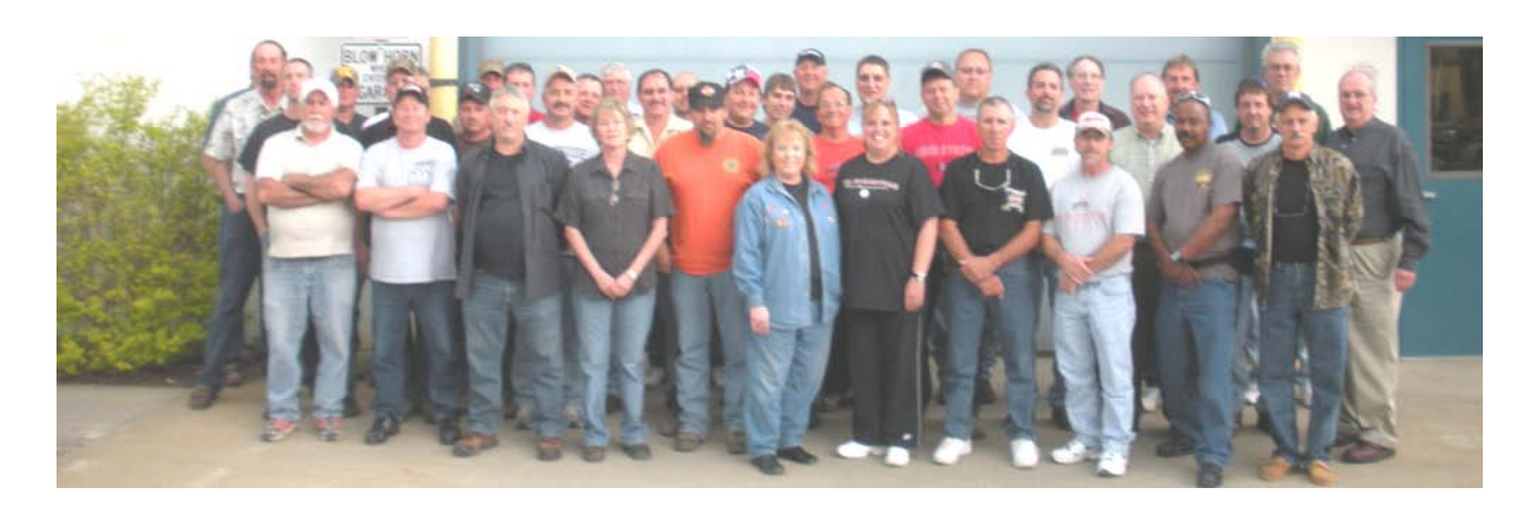
2010 Employee Safety Meeting