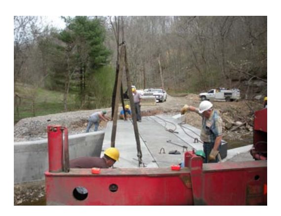
Two bridge replacements are nearly complete on Richland Township Road 284, Bull Run. Both bridges were force account projects with the concrete beams being supplied by Carr Concrete.