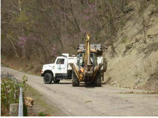
The top two photos show ditching on County Road 10, Crabapple Road and the bottom two photos are of ditching on County Road 48, Wegee Road.